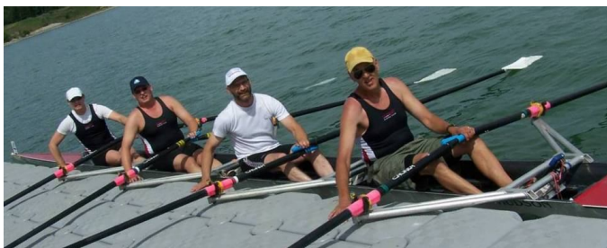
Back from the war... even came in 3rd!