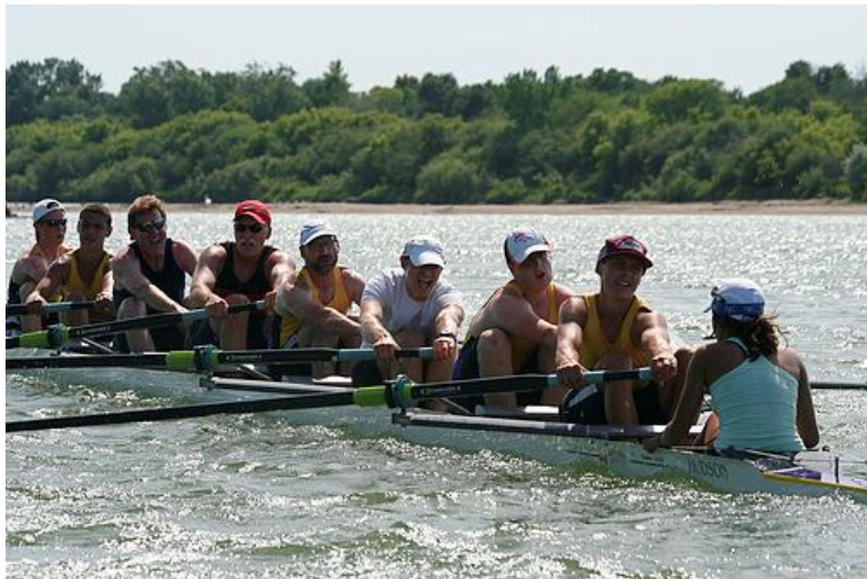
A composite men's eight crew (above) took on the CSG eight (right)