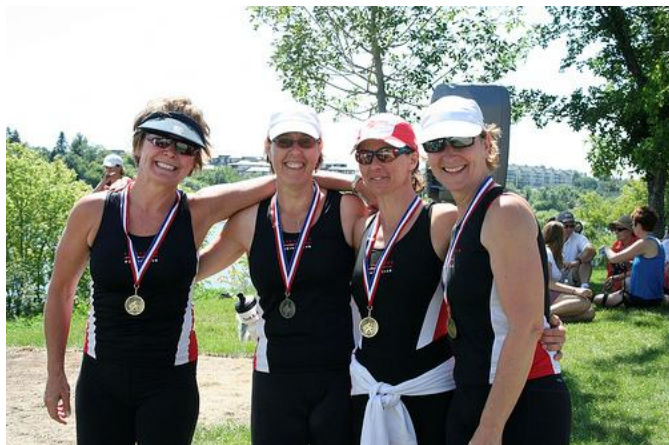
Our Master Women's Quad takes 1st.