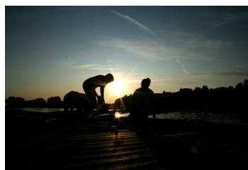
Early morning row— 2009